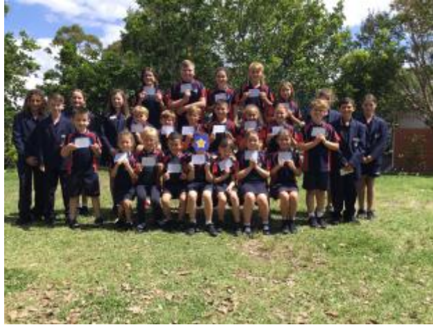
1 - House Captains, SRC and Aboriginal Representatives