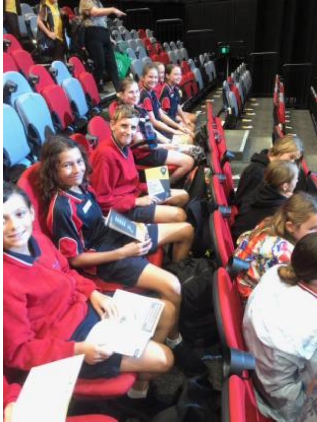
1 - Ready to learn the nuances of leadership.