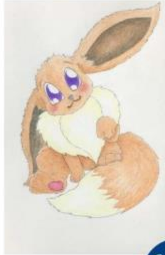
Drawing Pokémon with Monika