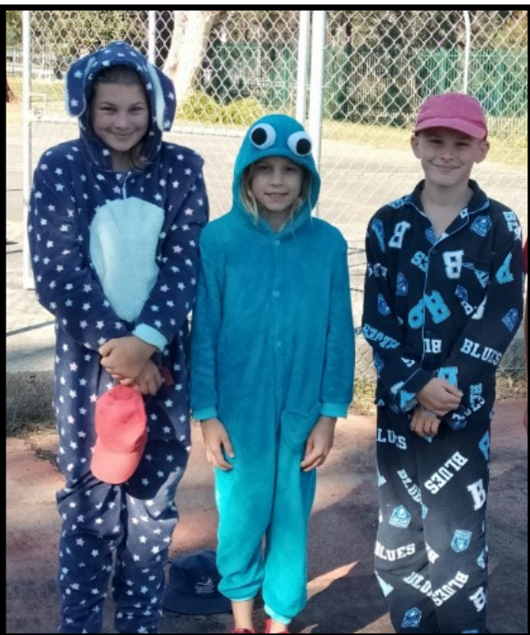
Extra Play time!