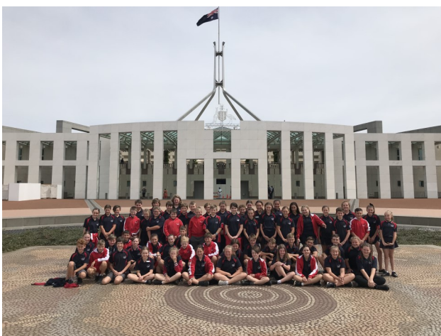
Year 6 Students

On Friday, 1 st November we went to the AIS where we were lucky enough to watch the basketballer's practicing and experienced sports simulators for wheelchair basketball and cycling. Finally we went to The Royal Australian Mint, where we learned about the history of coins, saw how money was made and saw two robots – Penny and Titan – move large buckets of money and blank coins around the mint. Overall, we had a great time, and would like to thank the teachers for taking time away from their own homes to allow us to have such a great experience.