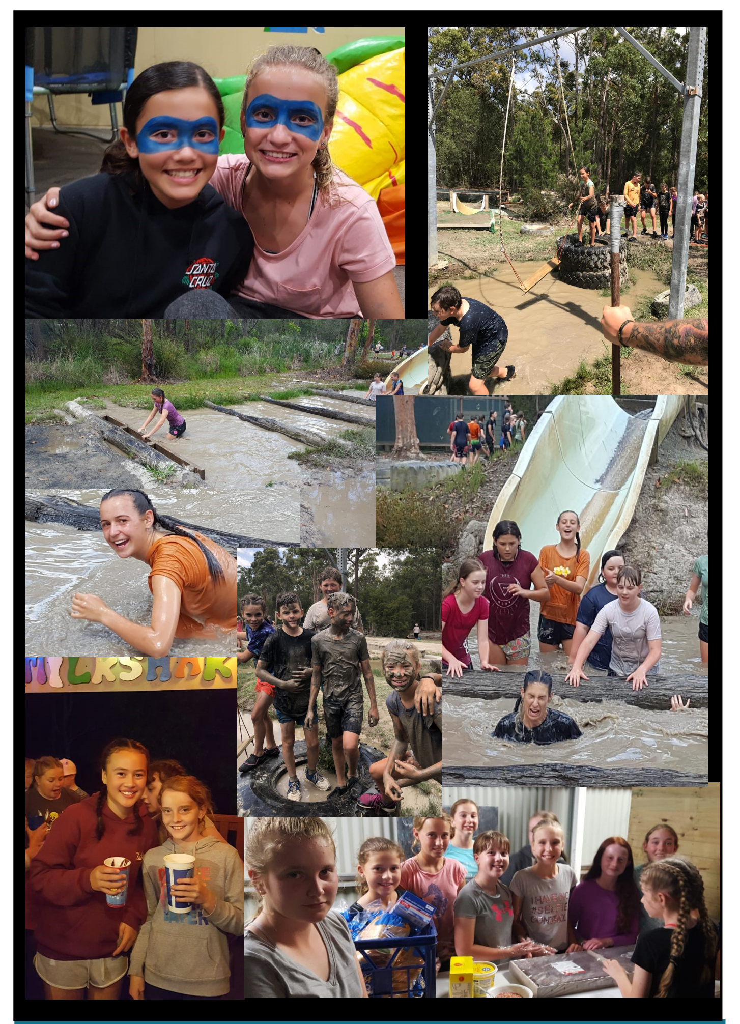
Communicating with our valued community