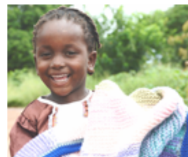
A girl from Kabvuma village, Zambia

*Typhoon Haima was the second storm within a week to hit large parts of the Philippines in October 2016 and Wrap with Love was able to immediately provide almost 1000 Wraps for the relief effort.